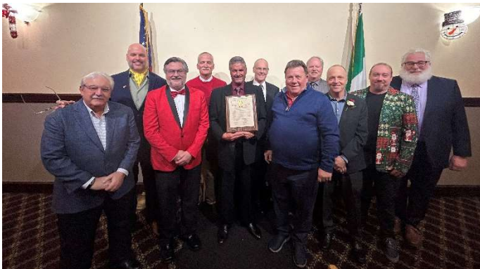
Roma Board Displaying the Proclamation from the State of Wisconsin recognizing the 100 th Anniversary of Roma Lodge