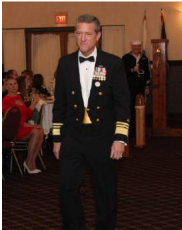
VADM Debbink is "Piped Aboard"