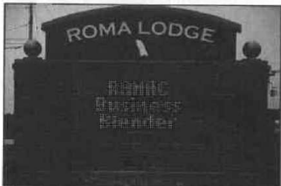
Roma Lodge hosted a Business Blender on July 16. It was noted that there were many 'first timers' at this event – and, not surprising, the food was a hit!

How does RAMAC membership help your business? RAMAC has helped us tremendously with the ability to network with local business leaders. We enjoyed hosting the RAMAC Business Blender in July!