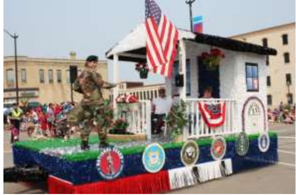
The Award Winning Float!