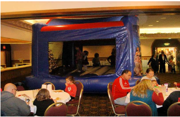
The Bouncy House – a Place to Play While Waiting for Santa