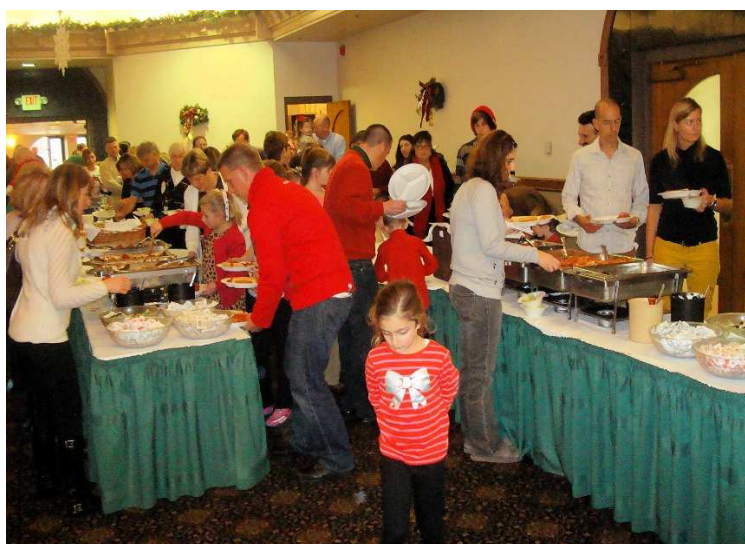
New Menu is a Big Hit with Children and Parents Alike