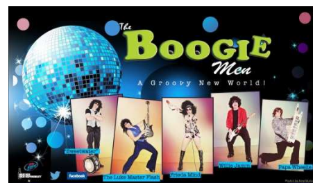
The Boogie Men