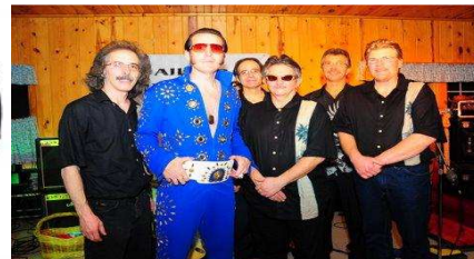
All the Kings Men