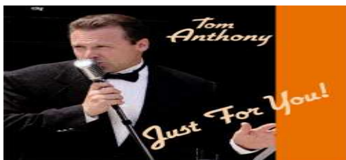
Tom Anthony Group

TBD Tom Anthony Group The New Invaders All the Kings Men Evolution Karaoke Competition Fireworks