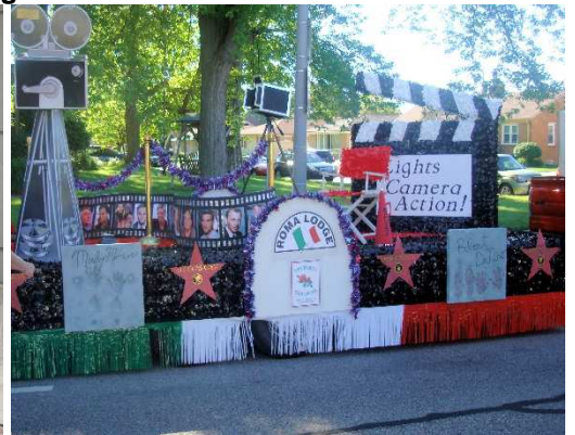
The Completed Project